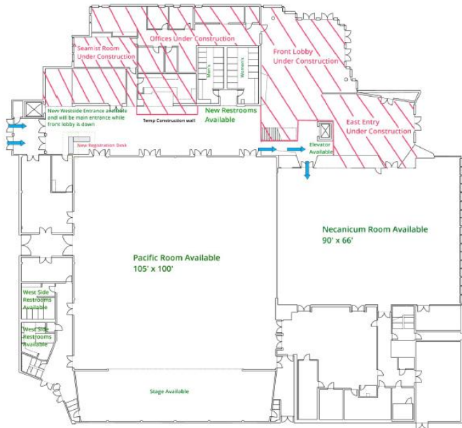
First Floor Layout

All formal sessions will take place in the Seaside Civic and Convention Center in the Necanicum West, Necanicum East, Seaside and Riverside B Conference Rooms.